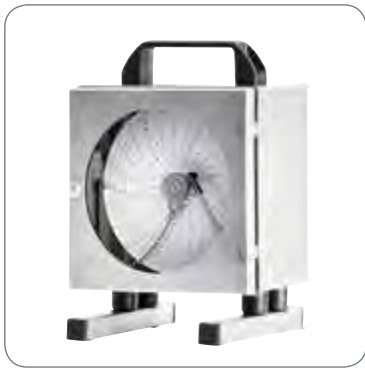
Free standing Chart recorders: HAPR19, HAPR28